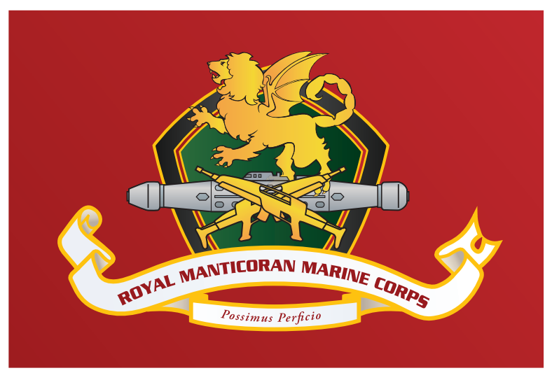
Flag of the Royal Manticoran Marine Corps