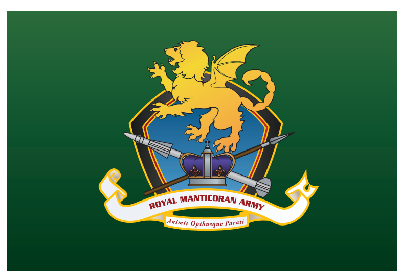
Flag of the Royal Manticoran Army