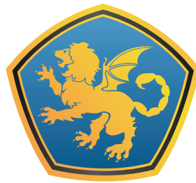
Royal Manticoran Army